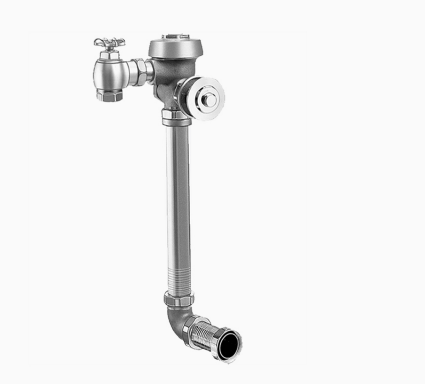
Variations Not Shown: Trap Primer and 3" Metal Oscillating Push Button