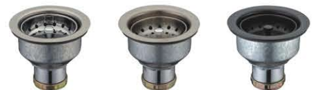
Deep Cup Basket Strainers