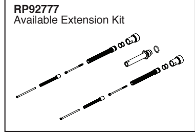
▲ Designate proper finish suffix

Brizo Kitchen & Bath Company reserves the right (1) to make changes in specifications and materials, and (2) to change or discontinue models, both without notice or obligation. Dimensions are for reference only. See current full-line price book or www.brizo.com for finish options and product availability.